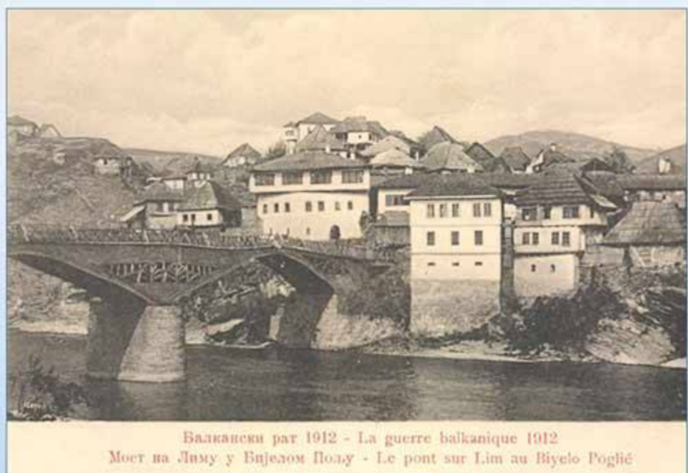
Балкански рат 1912 - La guerre balkanique 1912 Мост на Лиму у Бијелом Пољу - Le pont sur Lim au Bijelo Polje

Can you imagine that in this very place once there was an endless field of daisies, the flower which gave its name to both the field and the settlement, as well as today's town - Bijelo Polje? It was also taken over by the Turks who, after they conquered these areas, translated the name of the settlement into their language naming it Akovo. Nevertheless, if legend is to be believed, the nymphs who once-upon-a-time dwelt in the surrounding mountains take major credit for the name of the town. It is said that the nymphs from Mt Bjelasica were the most beautiful because they washed their faces with the